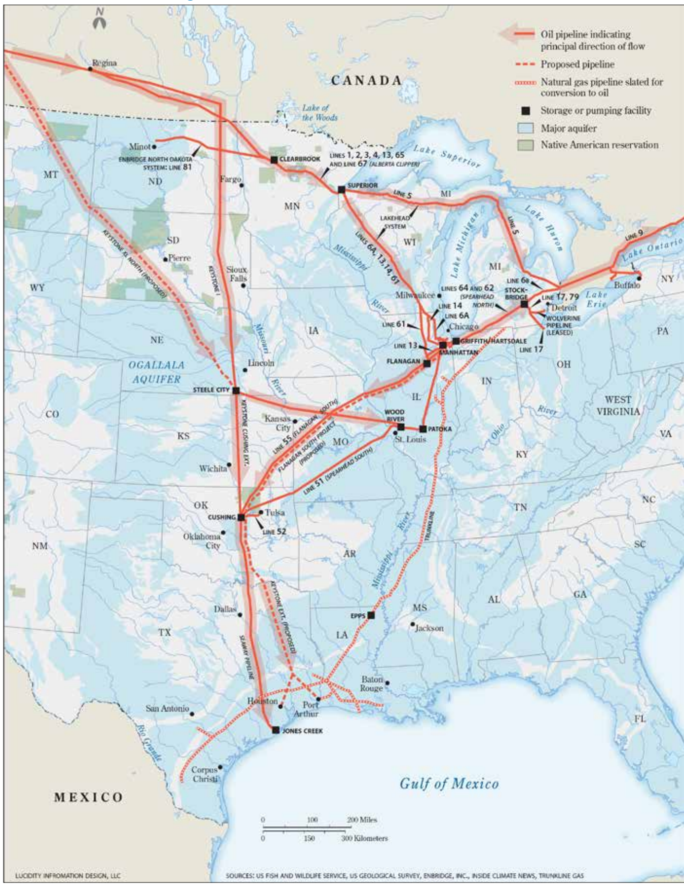
Figure 2: PROPOSED MIDWEST PIPELINE NETWORK

Existing pipeline infrastructure in the Midwest is already quite expansive, in terms of both geographic footprint and volume of petroleum. If Enbridge succeeds in completing its proposed pipeline expansions, the movement of petroleum in the Midwest would increase dramatically.